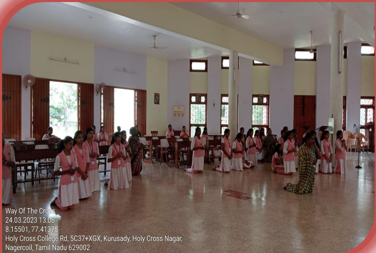
Way Of The Cross 24.03.2023 13:06 8.15501, 77.41378 Holy Cross College Rd, 5037+XGX, Kurusady, Holy Cross Nagar, Nagercoil, Tamil Nadu 629002

Title of the Program : Way of Cross Objective of the Program : To engage in Christ's work of reconciliation Date : 24.03.2023 Resource Person : Economics Venue : College Chapel Number of Beneficiaries : 65 Outcome of the Program : Filled with the presence of divinity